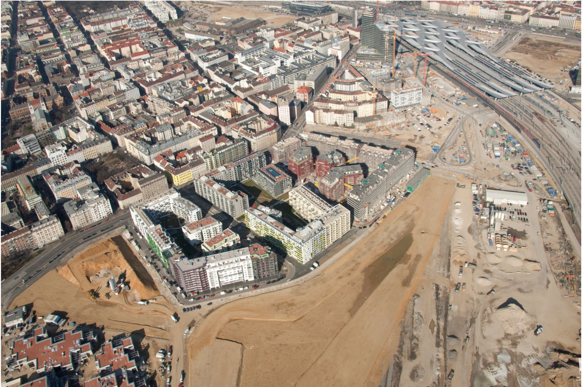
Sonnwendviertel neighbourhood at Hauptbahnhof